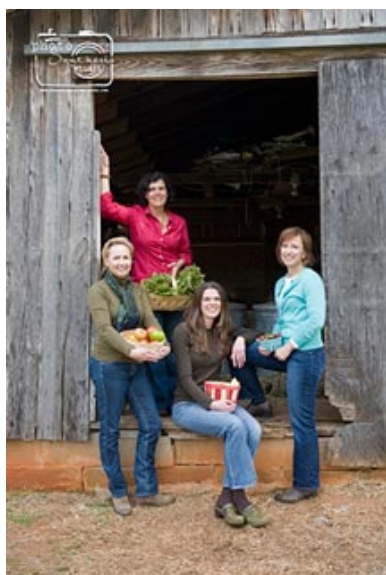
The Local Food Stop group at work

Are you looking for a great source of healthy, organic, local produce? Look no further!