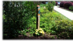
Peace Pole with Begonias

UUMAN Gardening Group cbsullivan@bellsouth.net