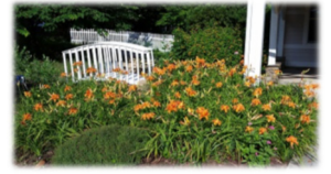
A field of Daylilies