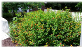
Lantana—happy this year, didn't bloom last year