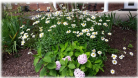
Hydrangea surrounded by Daylilies