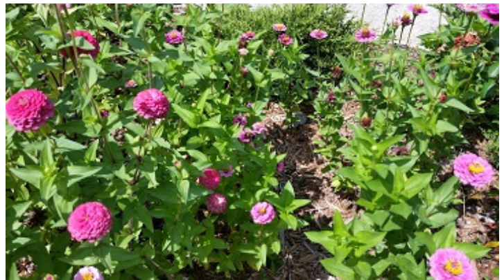
Zinnias with Bee