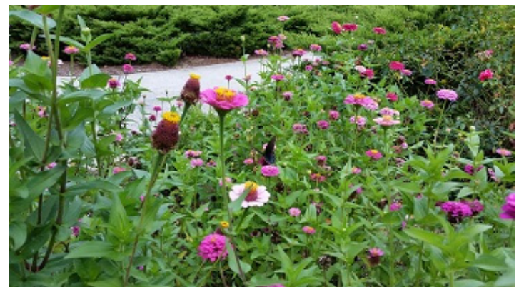
Zinnias with Butterfly