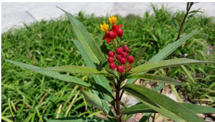
Orange Butterfly Weed