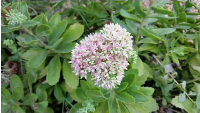
Autumn Joy Sedum